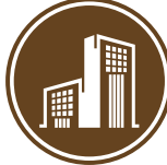
Infrastructure & Real Estate