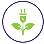
Sustainable & Renewable Energy