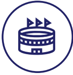
Sports & Leisure