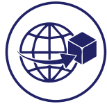
Trading & Logistics