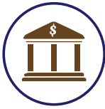
Banking & Finance