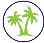
Tourism and Hospitality